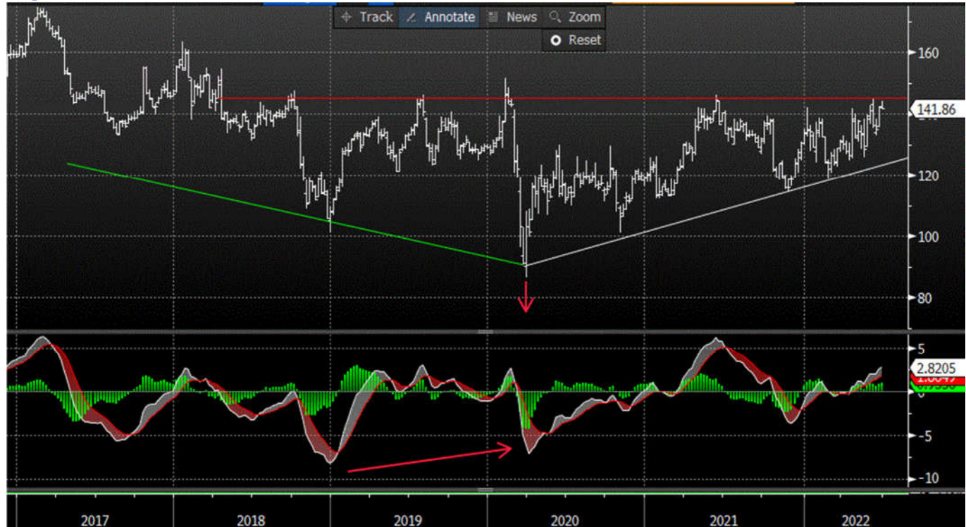
Fig. F-10 IBM (Weekly)

IBM had been emerging with the potential for a 5-year base (Fig. F-10) . In this rather symmetrical price profile around a pivot low (declining arrow), one can also notice a positive momentum divergence (see arrow, lower panel) in which the momentum held at a higher low while the price moved to its lowest level to date in 2019. Thereafter, price initiated a series of higher lows (along the uptrend, right of center from the pivot low), with price now addressing a flat, multi-year resistance (horizontal red line).