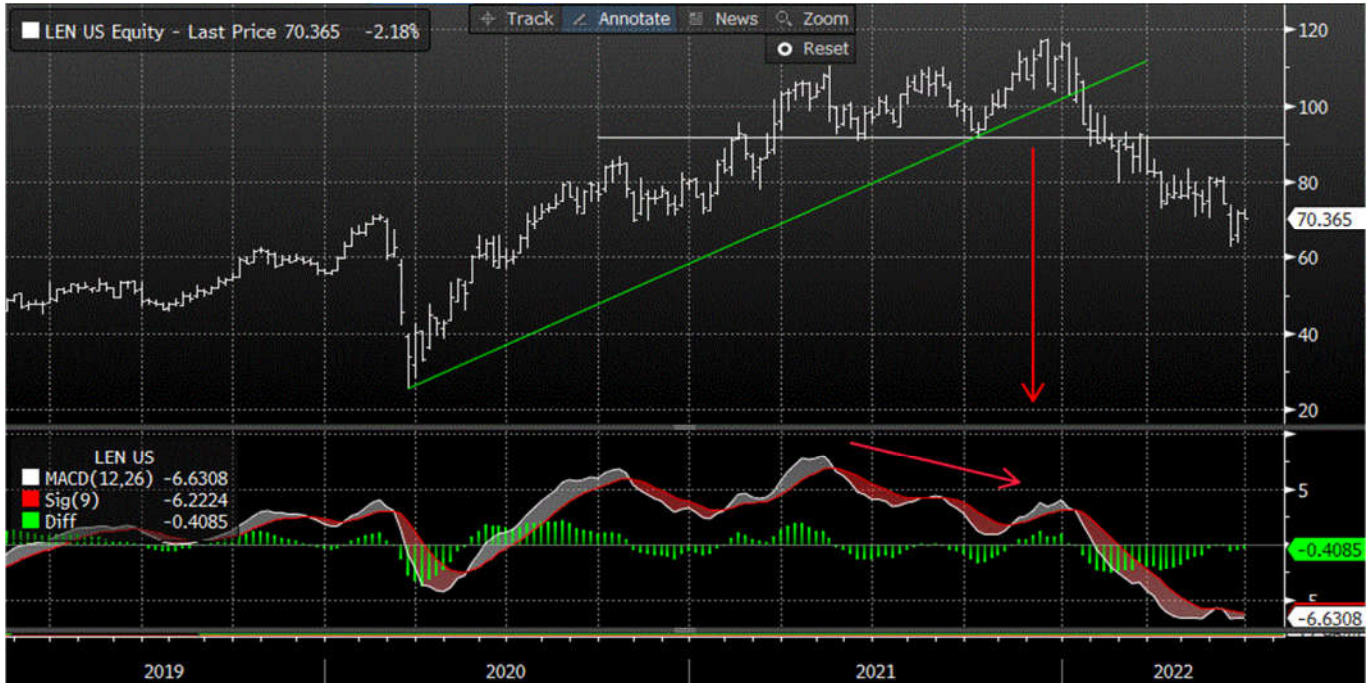
Fig. F-4 LEN (Weekly)