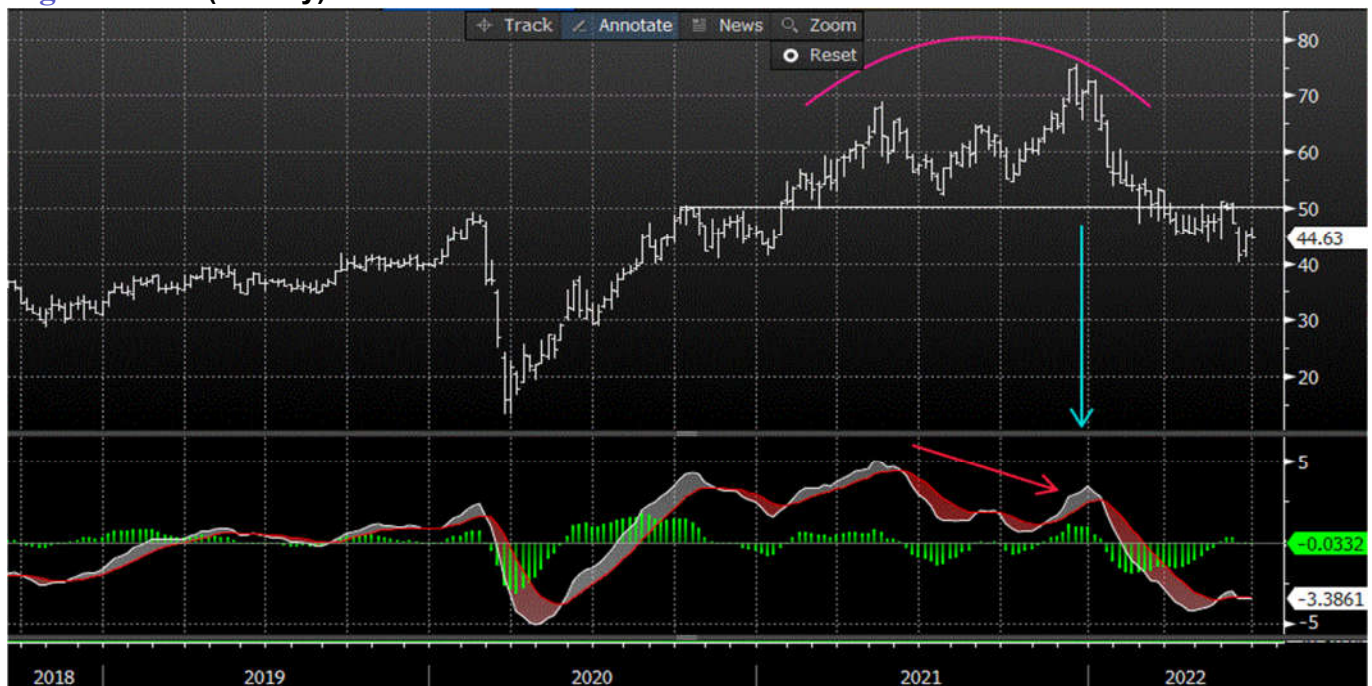
Fig. F-8 TOL (Weekly)