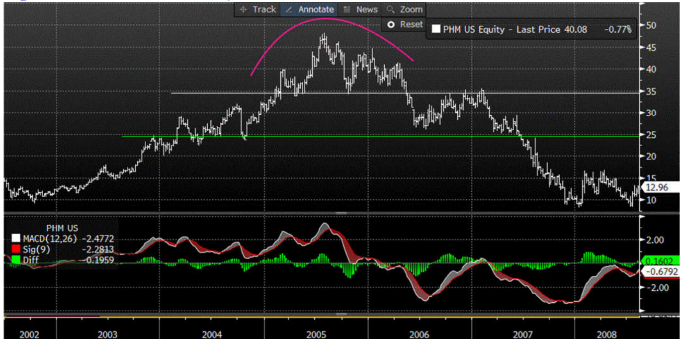
Fig. F-7 PHM 2002-2008 (Weekly)