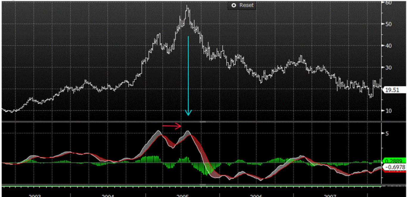
Fig. F-9 TOL 2003-2007 (Weekly)

TOL in 2005 offered a negative momentum divergence ( Fig. F-9 , arrows), and a rather steady decline into 2007 for another loss of 77%.