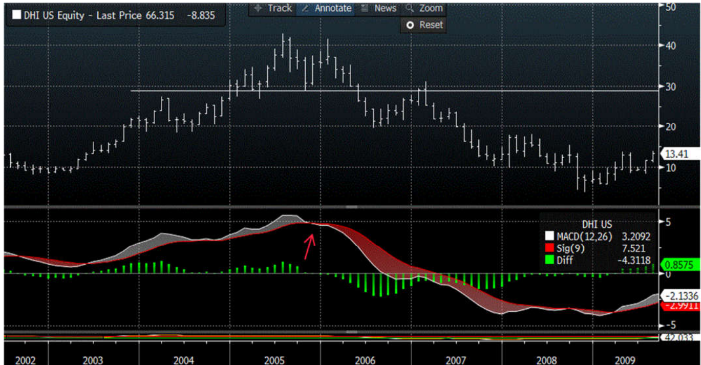
Fig. F-3 DHI 2003-2009 (Monthly)

Reflecting on DHI in 2006, a very similar topping profile was in evidence ( Fig. F-3 , horizontal support line), without the negative divergence, but replaced with the immediate monthly momentum Sell signal (see lower arrow). The initial decline in 2006 was followed by a rally into resistance, formerly support, followed by the remainder of the bear market decline from a high near 40 to a low near 10, for a 75% decline over 2 years (after which a new momentum Buy signal initiated in early 2009).