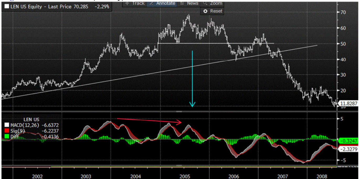
Fig. F-5 LEN 2002-2008 (Weekly)